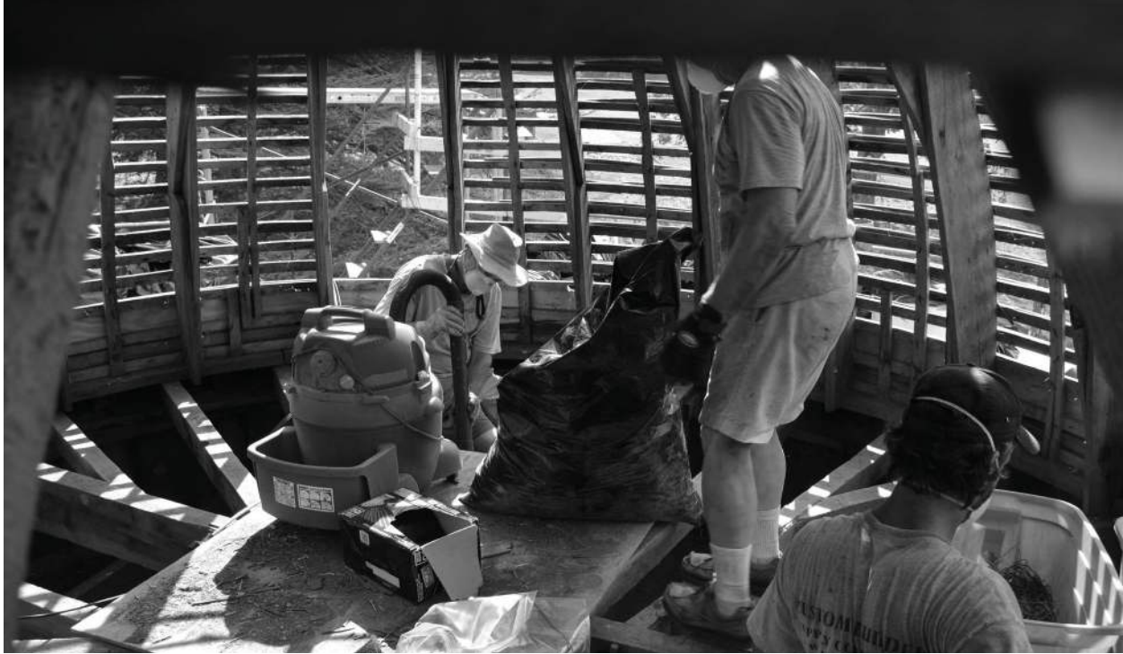
Once accessible, the restoration crew cleaned out decades worth of bird's nests, old shingles and other debris from inside the dome.