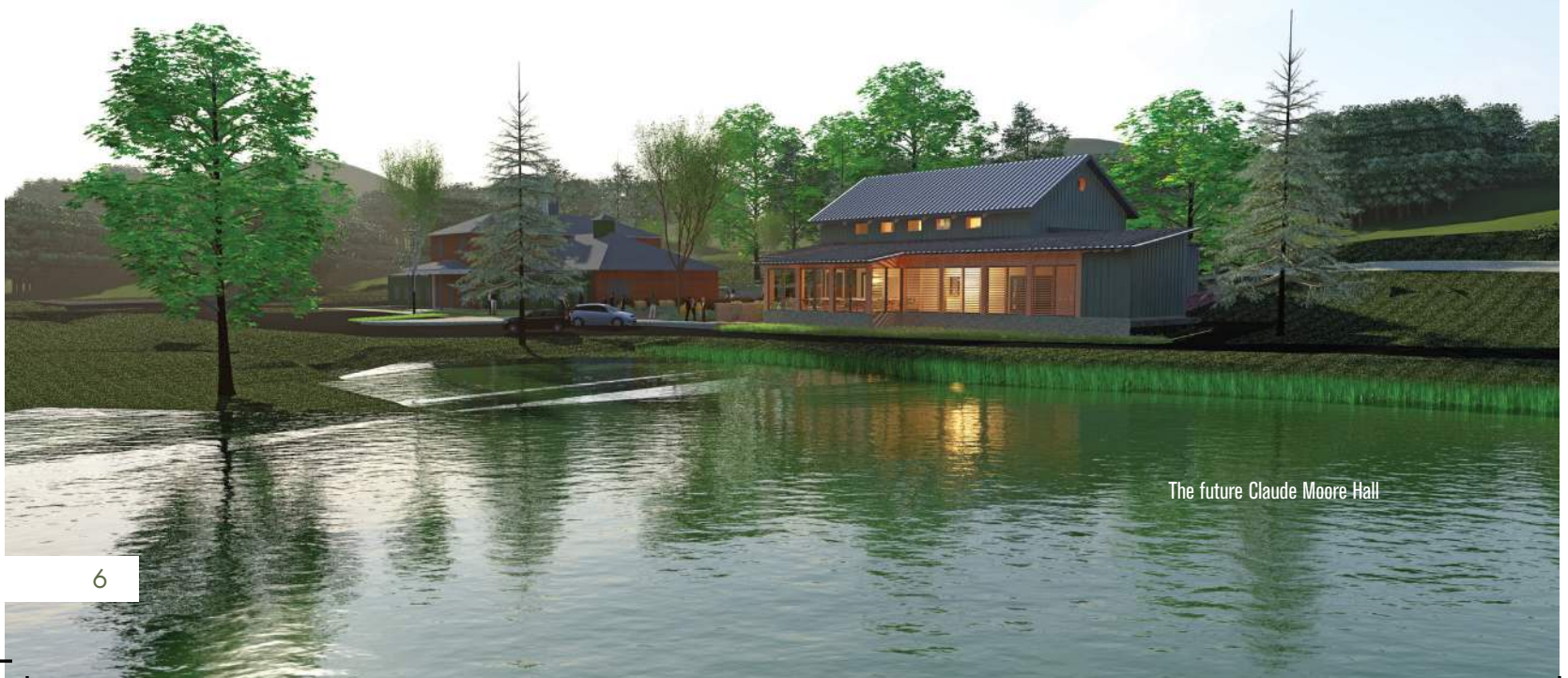
The future Claude Moore Hall